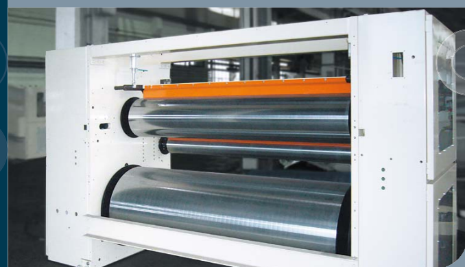
Cooling roller rack at Vits in Langenfeld, Germany, equipped with three cooling rollers (ø 200 mm, ø 400 mm and ø 800 mm) from AR Walzen.